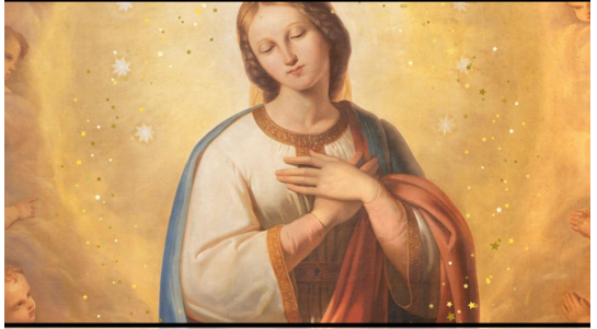
Thursday, December 8th Mass Times: 8:30am and 7:00pm