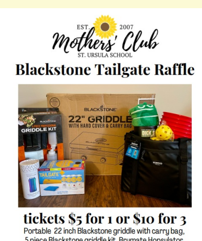
tickets $5 for 1 or $10 for 3 Portable 22 inch Blackstone griddle with carry bag, 5 piece Blackstone griddle kit, Brumate Hopsulator, High Noon seltzers, Igloo cooler, blanket & bucket pong bundle total value of $400 Winner need not be present at Ladies Night Out