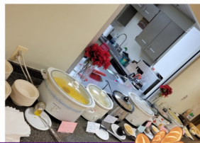
Soup and Salad Dinner in the Spiritual Center following Stations of the Cross